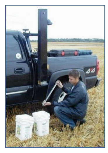
Figure 1. Soil sampling for lab analysis.