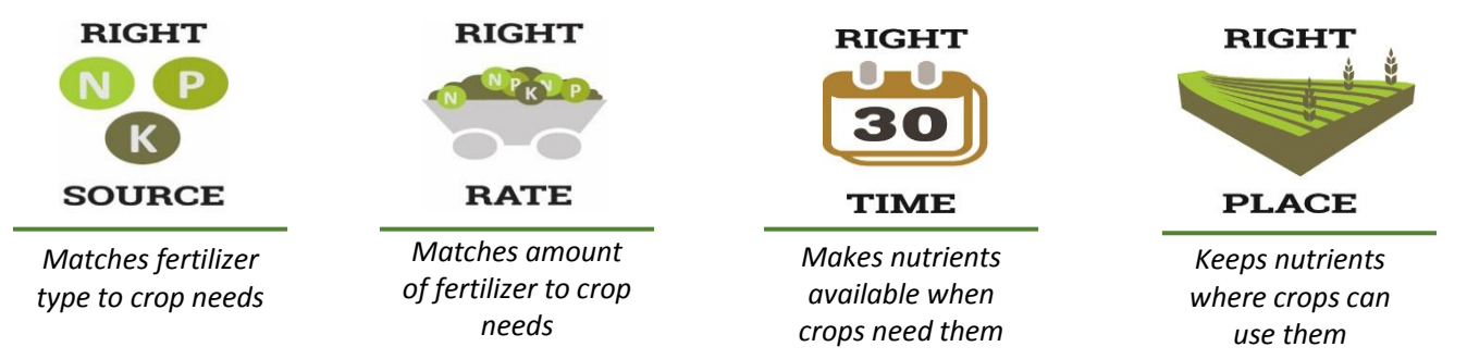
Figure 2. 4R Nutrient Stewardship (Right Source @ Right Rate, Right Time, Right Place ®).

4R Nutrient Stewardship is an internationally recognized framework that includes all of the components of comprehensive nutrient management. Applying fertilizers according to the principles of Right Source, Right Rate, Right Time and Right Place (the 4Rs; Figure 2) minimizes greenhouse gas emissions and losses of nutrients to surface and ground waters. The installation of tile drainage may require adjustment of any or all of the 4Rs.