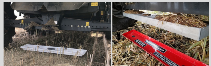
Figure 2. Drop Pans. Schergain (left; https://www.schergain.ca/pricing/ ), Bushel Plus (right; http://bushelplus.ca/bushel-plus-harvest-loss-system/ ).

Drop pans provided by Bushel Plus and Schergain ( Figure 2 ) were used to measure the canola losses from the combines. The drop pans were attached underneath the combine and were dropped once the combine reached a steady state.