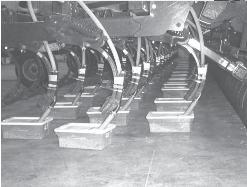
The collection tubs.