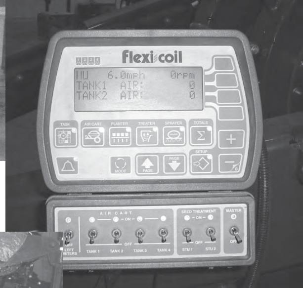
The Flexi-Coil air seeder monitor.