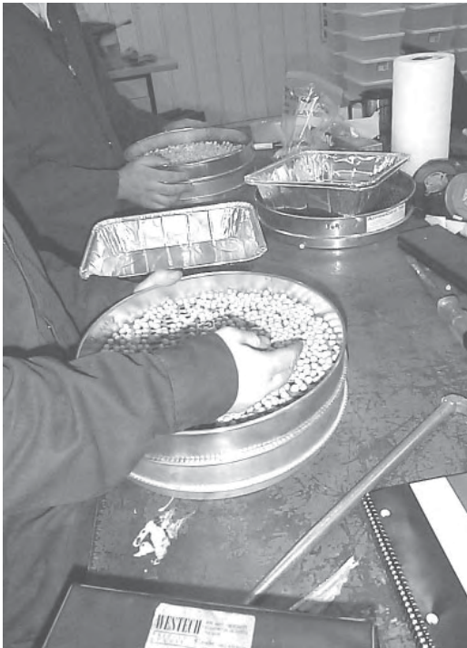
Sorting seeds for damage.