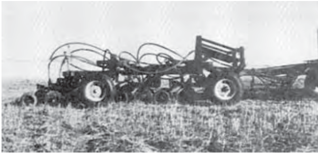
FIGURE 2. K-Hart Double Disk direct seeding units operating in field.