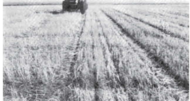
FIGURE 3. Soil surface before (left) and after (right) seeding into an untilled wheat stubble field.

very good. FIGURE 3 shows the soil surface before and after seeding into an untilled wheat stubble field. Soil and residue disturbance was very low. Ridge depths left by the units in untilled fields were 1 in (25 mm) or less. Ridge depths increased in soft soils or when seeding at deep depths. For instance, when seeding in soft moist soil the ridge was 2.5 in (64 mm).