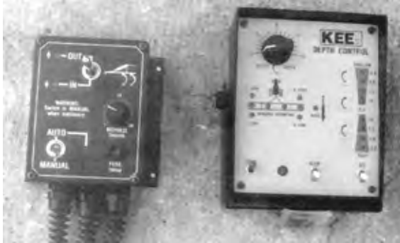
FIGURE 2. KEE hydraulic controller (left) and depth control box (right).

tion of each sensor. A "high" and "low" wing sensor light displayed when a wing depth was above or below the centre sensors by more than 1.2 in (3 cm). The implement depth could be manually or automatically controlled (FIGURE 2). In manual operation the operator was required to toggle the "implement out-in" switch to control the implement depth. In automatic operation the depth control electronically controlled the implement depth. An "auto" light on the control box displayed when the unit was automatically controlling the tractor hydraulics.