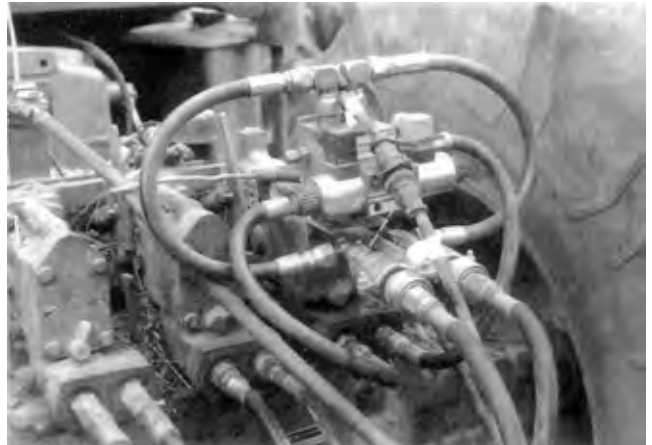
FIGURE 5. Hydraulic solenoid valve mounted at rear of tractor.

The junction box was mounted on the implement between the two centre frame sensors. The box was positioned in an area away from direct sunlight for the temperature sensor to work properly.