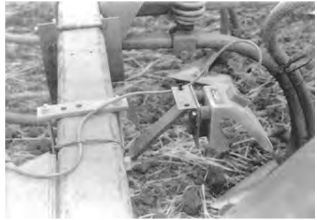
FIGURE 4. Ultrasonic sensor mounted on tillage frame.