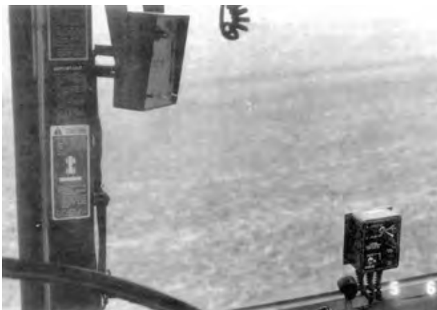
FIGURE 3. Depth control box and controller mounted in tractor cab.

The KEE control box and hydraulic controller (FIGURE 3) were installed in the tractor cab within easy reach and view of the operator. The throttle interlock switch was mounted to the tractor's throttle control. The ultrasonic sensors were secured to the implement frame by mounting brackets (FIGURE 4). Two sensors were mounted to a front frame member on the centre section, while one sensor was mounted to a front frame member on each wing frame. The manufacturer stated for proper operation of the sensors the distance between the sensor's backing plate and the tillage tool point had to be 26.5 in (70 cm).