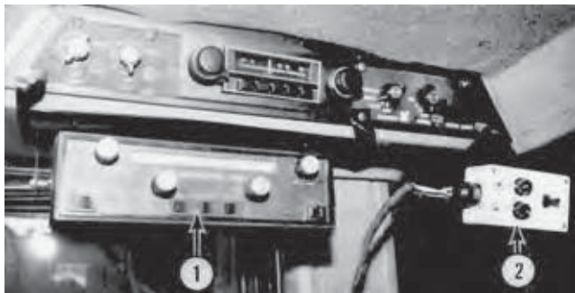
FIGURE 2. Microtek Depth Monitor (1) and Automatic Control Box (2) Mounted in Cab of Tractor.

The Microtek depth control system was easily installed. FIGURE 2 shows installation of the depth monitor and automatic depth control box in the cab of a Case 4694 tractor. It was necessary to fabricate a mounting bracket to mount the monitor, while the control box had an adhesive strip on the bottom to allow for quick installation.