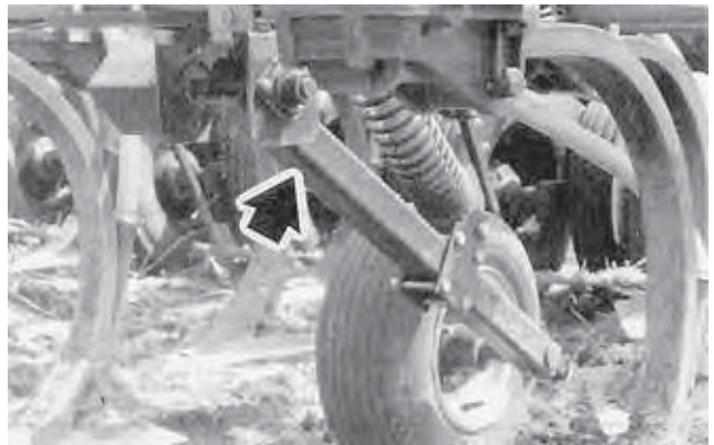
FIGURE 4. Microtek Gauge Wheel Mounted on Cultivator Frame.

Installation of the monitor console, depth control box, electro-hydraulic valve and three depth gauge wheels took one man approximately four hours.