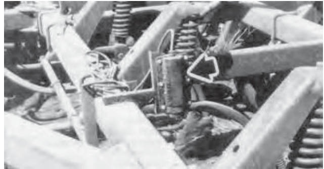
FIGURE 4. Senstek DCM-2 Depth Sensor Mounted on Cultivator Frame.

Installation of the control console, electro-hydraulic valve, temperature sensor and three depth sensors took one man approximately three hours.