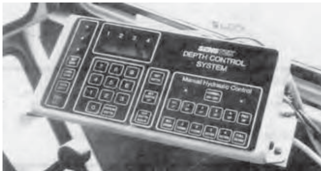
FIGURE 2. Senstek DCM-2 Control Console Mounted in Tractor Cab.

The Senstek DCM-2 depth control system was easily installed. FIGURE 2 shows installation of the control console in the cab of a Case 4690 tractor. Two holes had to be drilled in the tractor cab to mount the console.