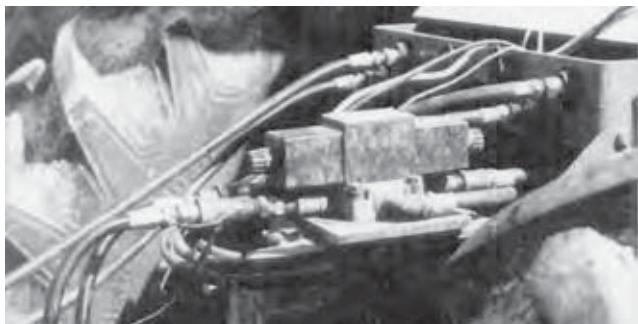
FIGURE 3. Electro-hydraulic Solenoid Valve Mounted at Rear of Tractor.

A bracket was fabricated to mount the electro-hydraulic solenoid valve on the rear frame member of the model Case 4690 tractor (FIGURE 3). The valve could also have been mounted on the implement hitch. Hydraulic fittings, hoses and quick couplers were purchased to connect the electro-hydraulic valve to the tractor hydraulics.