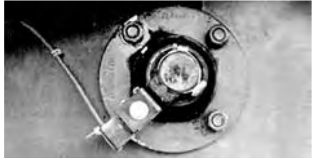
FIGURE 5. Detector and Magnet Mounted on a Straw Chopper Shaft.

Pull-apart connectors at the tractor and between individual drills were included to permit unhitching.