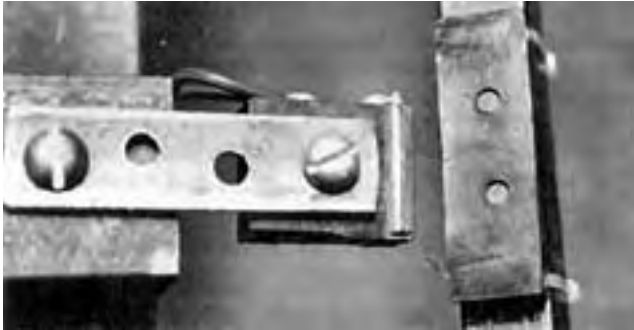
FIGURE 3. Bar Magnet Attached to the Seed Metering Shaft.

Installation on Grain Drills: Installing the detector system on a grain drill is fairly easy. Small bar magnets are attached to the seed metering shaft with plastic ties (FIGURE 3). A detector has to be installed adjacent to each magnet and is attached to the seed box or drill frame with a mounting bracket. The grain drill detector mounting brackets had to be fabricated as they were not supplied by the manufacturer. The detector can be located at any angle to the magnet but the painted end must be positioned within 6 mm (0.25 in) of the magnet.