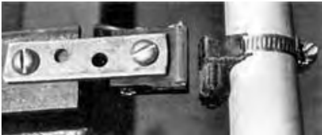
FIGURE 4. Hose Clamp Magnet Attached to the Primary Drill Drive Shaft.

The bar magnets were too long to fit between the seed cups on two different makes of press drills. On these drills, hose clamp magnets from the combine detector system had to be installed on the primary drive shafts (FIGURE 4) although in this location, the system could not detect failure of the seed metering drive chain. It is recommended that the manufacturer modify the bar magnets to permit installation on all common grain drills and supply suitable grain drill mounting brackets.