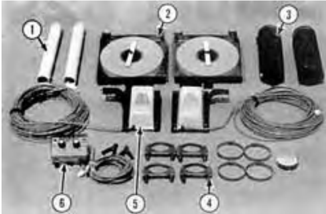
FIGURE 1. Marshall Paper Field Marker: 1) Paper Guide Tubes, 2) Paper Cassettes, 3) Windguard Tubes, 4) Mounting Hardware and Tape, 5) Cradles with Wiring Harness, 6) Control Box.