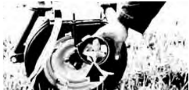
FIGURE 4. Plugged Windguard Tube.

Paper Delivery: Static electricity caused the paper to stick to the windguard tube wall and plug the windguard tube (FIGURE 4). Spraying water on the paper roll and windguard tube, as recommended by the manufacturer, temporarily stopped the paper sticking to the windguard tube. In Southern Alberta, the hot and dry conditions usually encountered during spraying caused the windguard tubes to plug several times an hour.