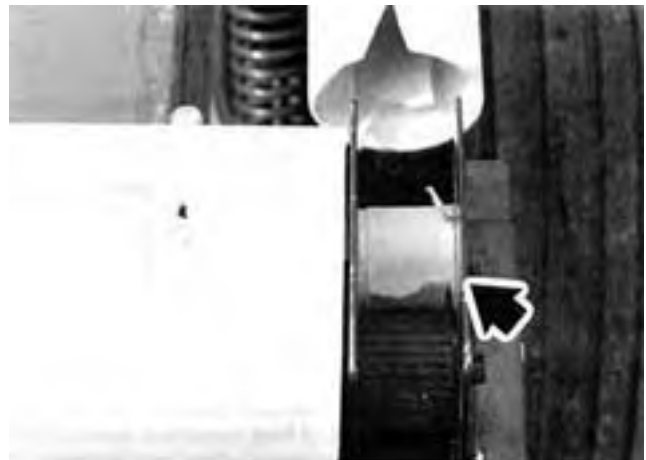
FIGURE 5. Paper Wrapped Around Cradle Roller.

The operator constantly had to watch the paper feeding through the windguard tube to avoid plugging. If a plugged windguard tube was not noticed quickly, the paper wrapped around the cradle rubber rollers (FIGURE 5). Removing the wrapped paper was difficult and required the use of a tool. Care had to be exercised to avoid bending the cradle assembly paper guides against the rubber rollers. Bent paper guides accelerated roller wear.