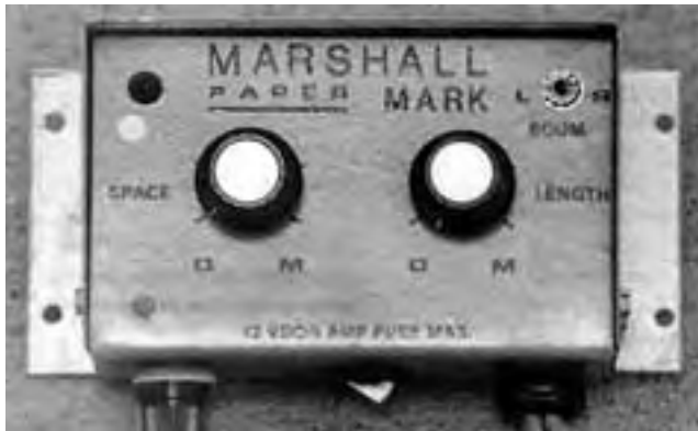
FIGURE 2. Control Box.

Operation of the control box required the operator to turn on the power switch and set the control switch to operate either the left or right end paper marker. The space between marks and length of mark were easily adjusted by the control knobs. At a desired space setting it was important to remember the spacing between marks increased with increased paper length settings. The additional time needed to deliver the extra length of paper resulted in increased spacings between paper marks.