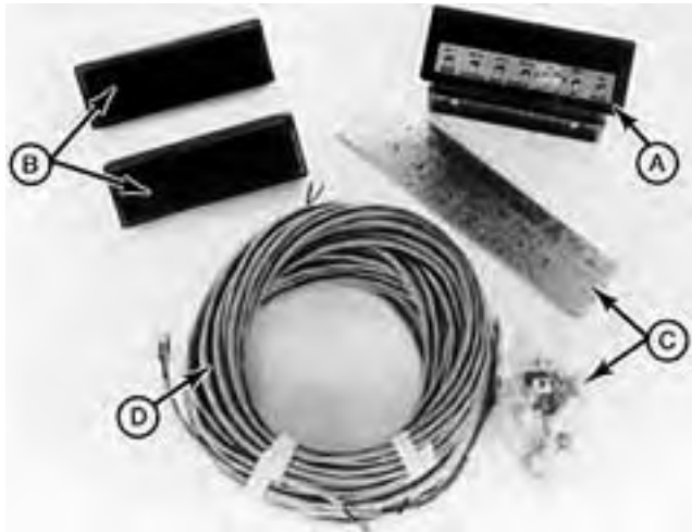
FIGURE 1. BEE Model 7410 Combine Loss Monitor: (A) Control Box (B) Sensors (C) Mounting Hardware (D) Wiring Harness.