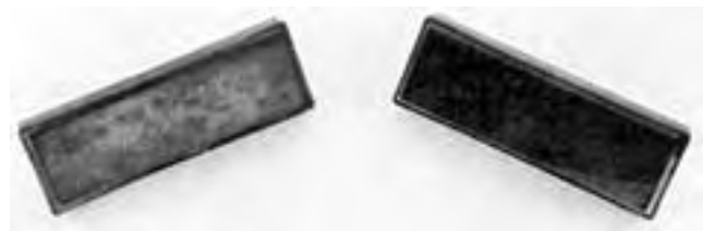
FIGURE 2. Sensors.

Sensor Installation: The BEE 7410 is supplied with two 156 x 56 mm (6.1 x 2.2 in) pad-type sensors (FIGURE 2) for mounting at the rear of the straw walkers and shoe.