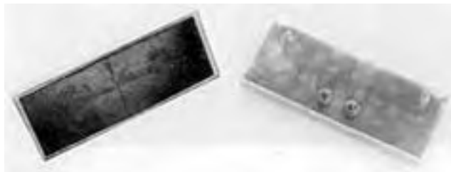
FIGURE 2. Sensors.

Sensor Installation: The Smith-Roles GM30 is supplied with two 182 x 71 mm (7.1 x 2.8 in) pad-type sensors (FIGURE 2) for mounting beneath the rear of the straw walkers and shoe.