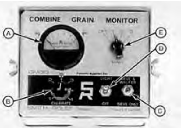
FIGURE 3. Control Box: (A) Loss Meter (B) Calibration Control (C) Sensor Selector Switch (D) Meter Illumination Switch (E) Power Switch and Meter Range Control.

Control Box and Wiring Harness: The control box (FIGURE 3) is supplied with a pivoting mounting bracket to permit easy installation at a suitable location in a tractor or combine cab. Sufficient cable ties and clamps are supplied to route the wiring harness from the sensors to the control box. An optional cable extension with a quick connector is available for use on pull-type combines.