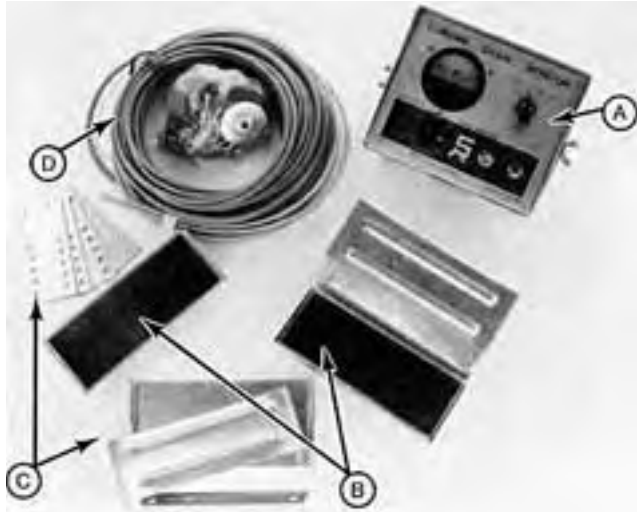
FIGURE 1. Smith-Roles GM30 Combine Grain Monitor: (A) Control Box (B) Sensors (C) Mounting Hardware (D) Wiring Harness.