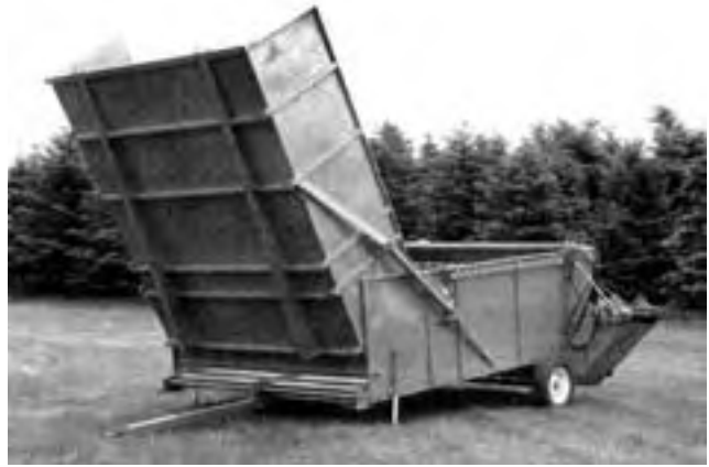
FIGURE 2. Transport Position.

During transport, the drawpole was permanently bent at the clevis hitch. It is recommended that the manufacturer modify the hitch and drawpole to prevent bending.