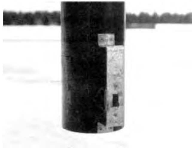
FIGURE 2. On-off Electrical Switch.

Operation: The telescoping downspout and flexible hose section made filling of a grain or fertilizer box very easy for one person. The on-off electrical switch (FIGURE 2), positioned in the handle on the downspout, was convenient and easy to use. It did not have to be held in the on position for continuous operation. Ample wire was provided to connect to most truck batteries.