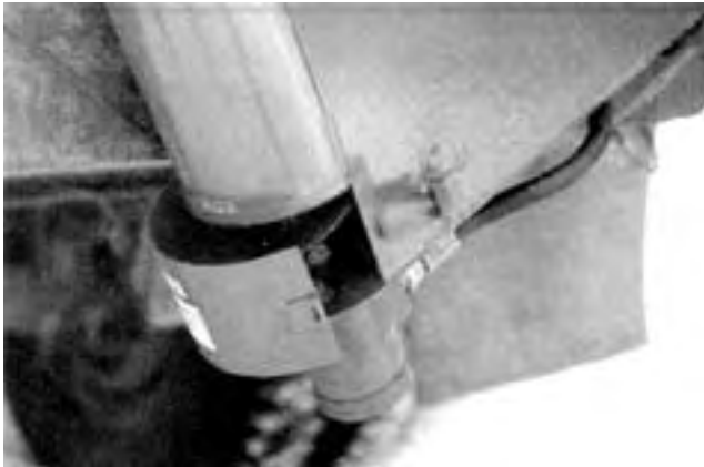
FIGURE 4. Auger Clean-out Gate.

centre latch held the clean-out gate tight against the outside of the auger tube. No leakage occurred throughout the test (FIGURE 4). General rating for operation was very good.