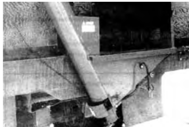
FIGURE 3. Removable Hopper Section.

During the course of the test, crops had to be changed and the removable portion of the hopper, allowed dumping the contents of the box without having to remove the drill fill or run the remaining material through the auger (FIGURE 3).