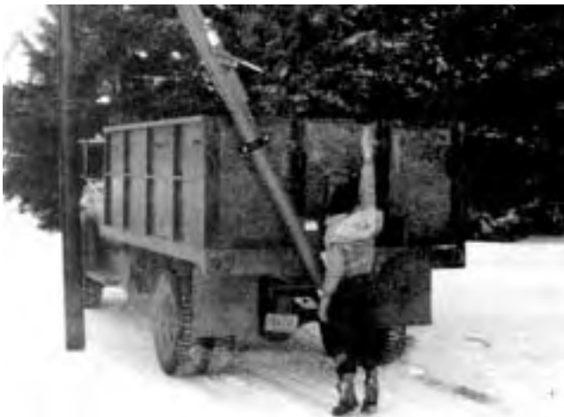
FIGURE 5. Folding Lever Difficult to Reach.

Transport: To place the auger in transport position, reaching the folding lever was difficult for an operator less than 6 ft (1.8 m) in height unless the truck box was tilted to at least a 30° truck box angle (FIGURE 5).