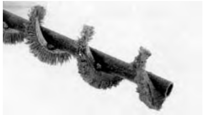
FIGURE 4. Bristle Flighting.