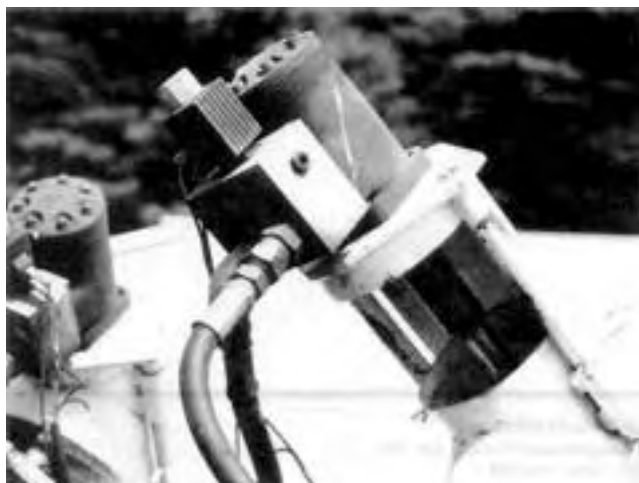
FIGURE 2. Anti-plugging Augers.

Capacity and power requirement tests were performed on optional and standard flightings. In addition, anti-plugging feature tests (FIGURE 2) were carried out on the augers and moisture resistance tests on the covers of compartments.