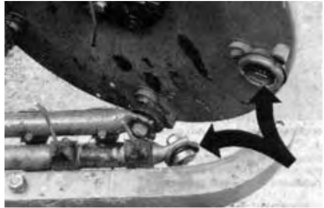
FIGURE 6. Bearing Failure.

At 46 hours, the bolt that locks the reel basket in place fell out and allowed the reel to fall to the ground and came in contact with the rear tire (FIGURE 8). In addition to destroying the tire, 19 reel teeth had to be replaced.