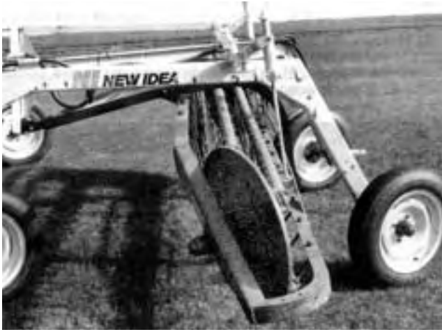
FIGURE 4. Suspension of the Rake Basket.