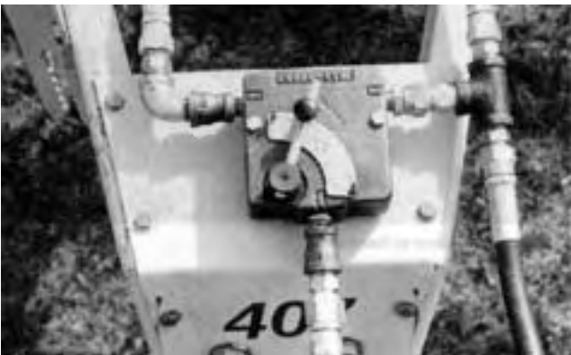
FIGURE 5. Optional Flow Control Valve to Limit Rake Reel Speed.

The operator's manual was well written and illustrated. It contained useful information on assembly, adjustment, transporting, safety and maintenance. The manufacturer provides as an option a flow valve (FIGURE 5) to limit rake reel speeds to a maximum of 140 rpm.