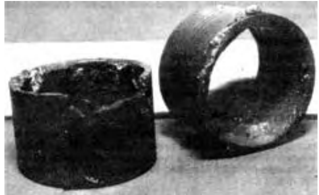
FIGURE 7. Castor Wheel Bushings.