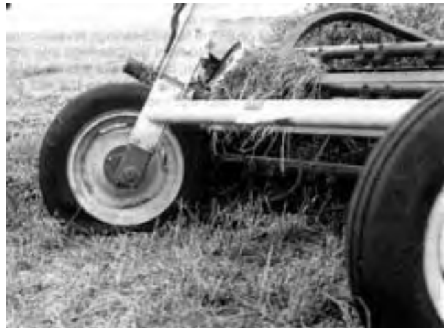
FIGURE 8. Bolt Failure on Reel Basket.