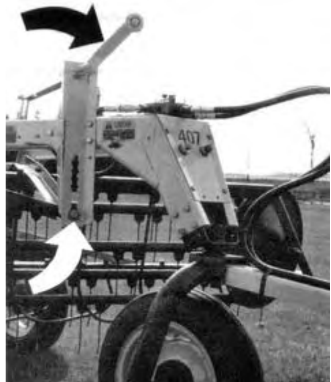
FIGURE 3. Height Adjustment Crank (top) Basket Adjustment Bolt (bottom).

Height adjustment was achieved by turning the crank handles (FIGURE 3) provided on the 406 and 407 until the required height was reached. The 406 and 407 were cranked to their maximum height to place in transport position. The rake basket was suspended on twin spring threaded rods (FIGURE 4) to provide floatation, and leveling of the rakes was carried out by turning the nut attached to the tops of these rods. The tilt of the basket was also adjustable and was accomplished by positioning and tightening the retaining bolt (FIGURE 3) in the slot at whatever position was desired. If loose fluffy windrows were desired the bolt was positioned to the upper notch in order to tilt the teeth forward. If a tightly rolled windrow was desired then the retaining bolt was positioned in the lower notches.