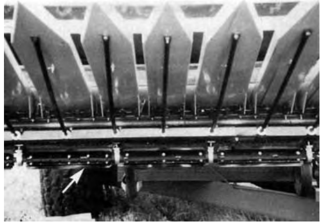
FIGURE 3. Stalkwalker.

Stubble Length: The conveyor was operated at the point where the 100 mm (4 in) rubber flights on the conveyor belt just touched the tops of the seed pans above the cutterbar. The maximum amount of stalk cut off with each head was about 250 mm (10 in). To maximize combine capacity, the stubble should be as long as possible, with only the sunflower heads fed into the combine. The stalkwalker (FIGURE 3) helped pull the taller plants down to the level of the seed pans before they were cut off.