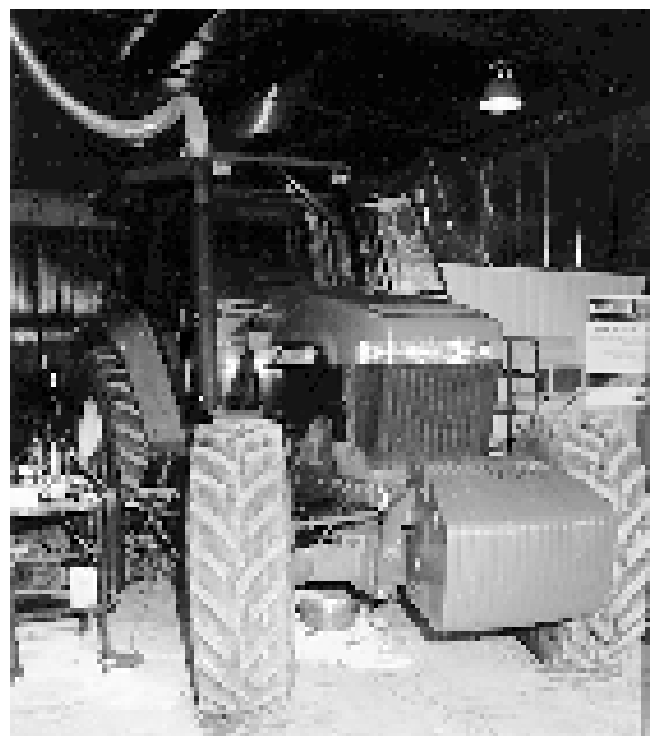
Specialized instrumentation is used to measure fuel consumption during a test.