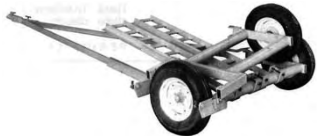
FIGURE 2. Transporter in Folded Position.

The Smith-Roles transporter (FIGURE 1) is designed for transporting self-propelled windrowers. The 3.5 m wide, hinged, tubular cradle is supported by three wheels and an angle A-frame hitch, when used in the loaded towing configuration. For unloaded travel, the hinged cradle can be folded to reduce the transporter width (FIGURE 2).