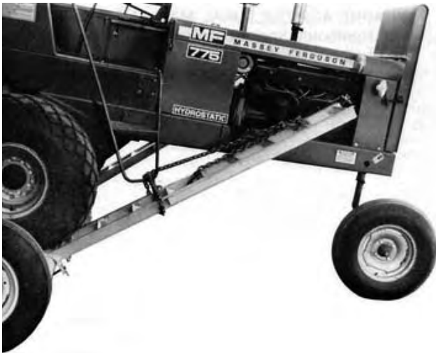
FIGURE 3. Ramps Raised for Transporting.

Windrowers were loaded by driving forward, up the ramps, until the drive wheels dropped into the cradle. The ramps then had to be raised manually and secured to the windrower frame before transporting (FIGURE 3). This was difficult for one person. Most windrowers did not have sufficient table lift to clear the centre wheel during loading. For loading these machines, the transporter was placed in a small ditch to provide adequate clearance. In all cases, the windrower drive wheels seated firmly into the cradle with little possibility of them bouncing out during transport. However, it is recommended that the operator secure the wheels to the cradle for transport on public roads.