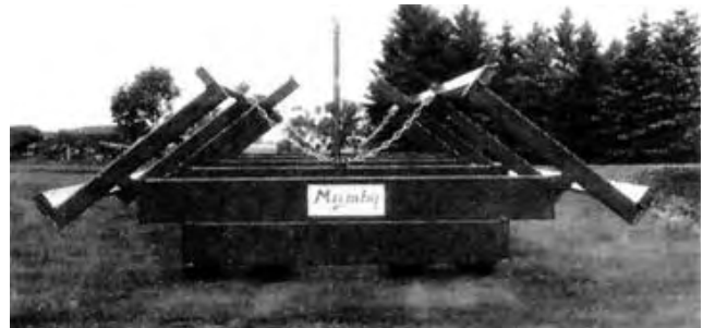
FIGURE 3. Tilting Bale Beds.

Unloading: The Mumby round bale mover was very easy to unload and took about 30 seconds. Unloading consisted of backing or stopping at the desired unloading site, releasing the lock pins that hold the bale beds in transport position and turning the crank handle on the winch until the bales rolled from the tilted beds (FIGURE 3). Sometimes one bed would unload before the other causing a load imbalance which would cause the side of the wagon that unloaded first to raise off the ground. This created a dangerous situation for the operator who was standing either beside the hitch rails or inside of them. PAMI's rating was fair.