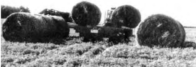
FIGURE 2. Space Left Between Unloaded Bales.

The Mumby did not impart any aggressive action on the bales, and crop losses were considered negligible. It did however place the bales in different orientation from which they settle on the ground after baling, reducing the bales' ability to shed moisture. When unloaded, the windrows of bales were placed about 24 ft (7.3 m) apart, which required rehandling with the front-end loader (FIGURE 2).