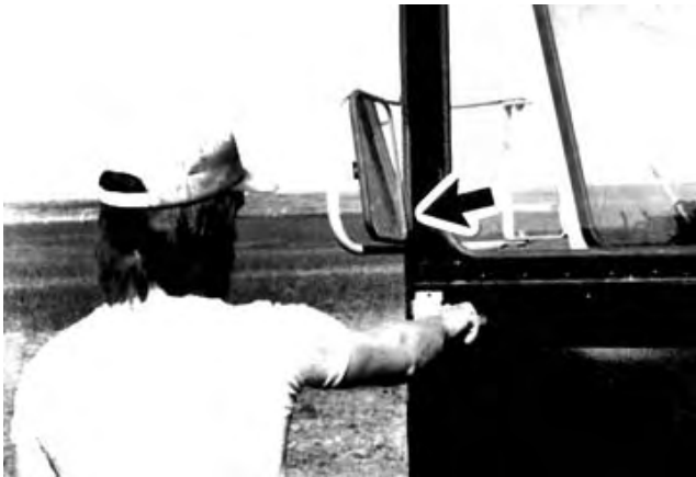
FIGURE 7. Interference between Rear View Mirror and Cab Door.

The rear view mirror provided poor rear visibility when loaded. Interference between the cab door and mirror (FIGURE 7) prevented the door from completely opening. Modifications to the rear view mirror location are recommended to eliminate door interference and to improve rear visibility when loaded.