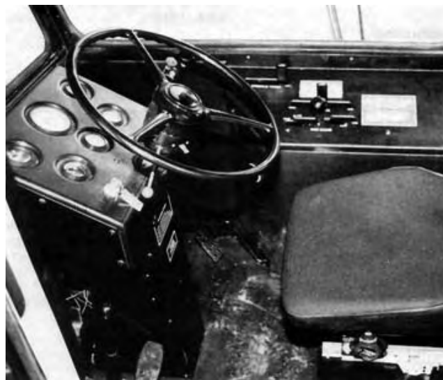
FIGURE 6. New Holland 8500 Instrument and Control Arrangement.

Instruments and Controls: FIGURE 6 shows the instrument and control arrangement of the New Holland 8500 operator's cab. Loader and load deck controls were easily accessible from the operator location. Visibility of the loader was very good. The gear shift lever and foot throttle were inconveniently located. The operator had to reach forward to shift gears while maintaining an awkward leg position. Operator fatigue occurred after several hours. Modifications to the gear shift lever and foot throttle locations are recommended.