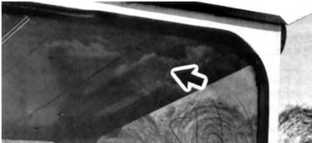
FIGURE 12. Damaged Cab Window.