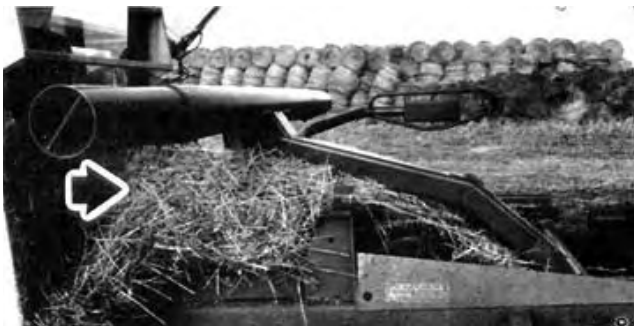
FIGURE 8. Collection of Loose Material below Pusher.

Loose material often collected below the pusher (FIGURE 8). Pusher operation was not affected but excessive build-up required occasional removal.