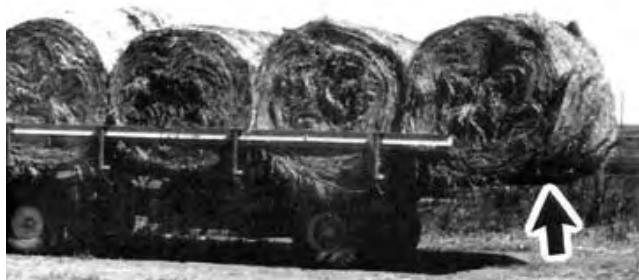
FIGURE 3. Partially Opened Tailgate when Loaded with Eight, 72 in Diameter Bales.

Load Quality: The New Holland 8500 formed a durable load, which transported well with little shifting or settling. Material loss during transporting was negligible. When handling 72 in (1830 mm) diameter bales, the tailgate was forced partially open during the last cycle of the pusher (FIGURE 3). The partially opened tailgate did not affect load quality. However, to ensure safe road transport, modifications to permit adequate accommodation of eight, 72 in (1830 mm) diameter bales are recommended.