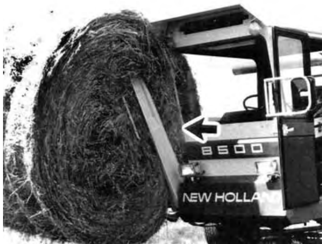
FIGURE 2. Bale Interference with the Operator's Cab while Loading 72 in (1830 mm) Soft Core Hay Bales.

When loading loosely formed or poorly tied bales, the cross conveyor arm occasionally slipped beneath the bale and failed to push the bale to the left side of the load deck. When loading 72 in (1830 mm) diameter soft core hay bales, the inside edge of the bale often interfered with the right side of the operator's cab (FIGURE 2). Modifications are recommended to eliminate this interference as damage to the operator's cab side window occurred on four occasions.