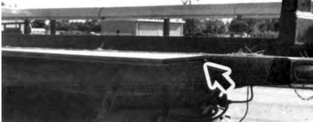
FIGURE 11. Bent Load Rack Extensions.