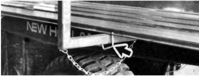
FIGURE 10. Bent Load Rack Extension J-Pins.