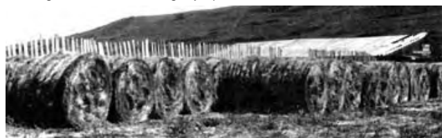
FIGURE 4. Bale Placement with New Holland 8500.

Placement Quality: Placement quality was good with solid, well formed bales (FIGURE 4). The New Holland 8500 placed bales in two rows with the circumferences of each bale touching in each row. Bale spacing was not possible within each load. Adjacent loads, however, could be easily spaced according to operator preference. An experienced operator could place adjacent loads together forming uniform rows of tightly spaced bales.