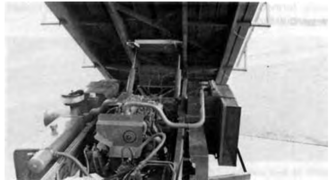
FIGURE 9. Limited Visibility when Backing into Unloading Position.

Extreme care must be used when working under a raised deck. A mechanical lock was provided for the load deck.