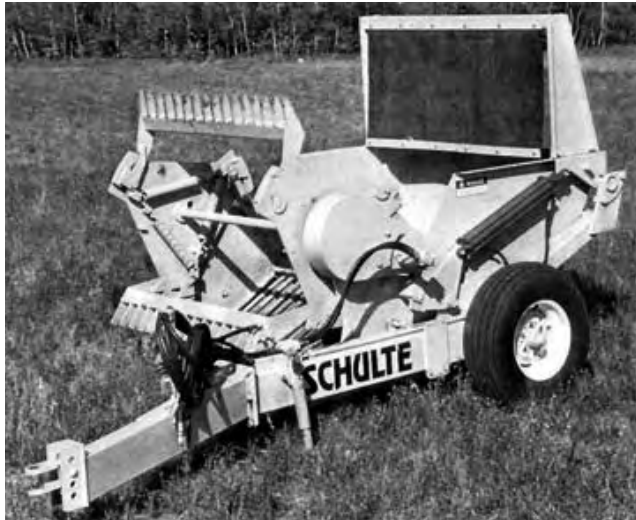
FIGURE 1. Schulte RS 600 Rock Picker.

$6,210.00 (September, 1982, f.o.b. Humboldt, complete with optional hydraulic drive).