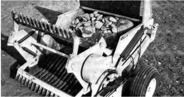
FIGURE 4. Typical Hopper Load.

Hopper Dumping: The hopper held about 1809 kg (3980 lb) of large or small rocks when completely filled (FIGURE 4). One pair of tractor remote hydraulic outlets raised the hopper for dumping and controlled the grate height. To dump the hopper, the hydraulics were activated to lower the grate. With the grate fully lowered the hopper began to rise. The hopper emptied completely and could pile rocks 1190 mm (47 in) high.