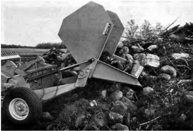
FIGURE 6. Rock Guard Frame Hitting a Rock Pile While Dumping.