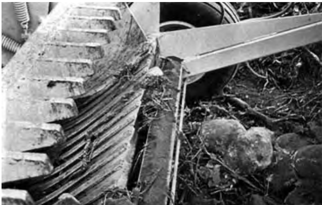
FIGURE 5. Rock and Soil Build-up at the Rear of the Grate.

Rocks and soil collected on the cross member at the rear of the grate and prevented the hopper from being completely lowered after dumping (FIGURE 5). Modifications to prevent rock and soil build-up at the rear of the grate are recommended.