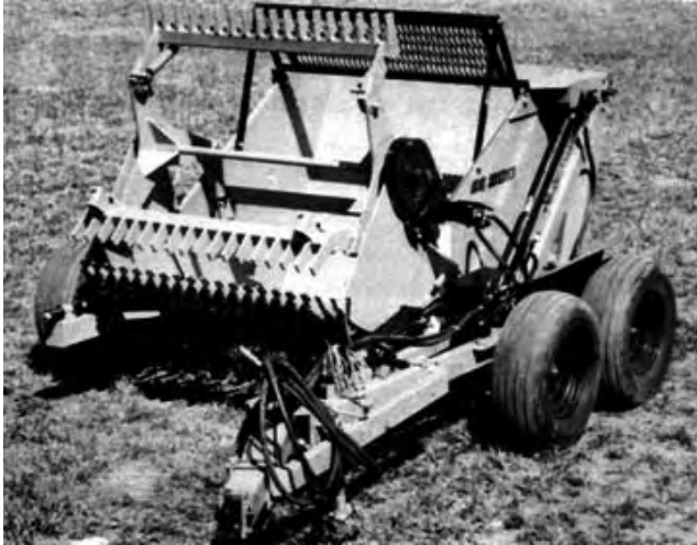
FIGURE 1. Rite-Way RR-800H Rotary Rock Picker.

$8,775.00 (December, 1981, f.o.b. Humboldt, complete with optional tandem wheels, hydraulic flow control valve and rock guard).