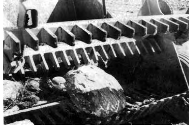
FIGURE 4. Typical Rock Jam.

The 1.5 m (58 in) grate was wide enough to accept most rock windrows. In non-windrowed areas of concentrated rock, a wider grate would be desirable.