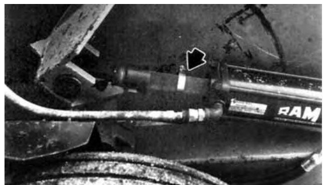
FIGURE 6. Transport Lock.

Transporting: The Rite-Way RR-800H was easily transported. It towed well at speeds up to 40 km/h (25 mph). The 207 mm (8 in) transport clearance was adequate. The transport locks were difficult to install and a storage location was not provided when they were not in use. To lock the grate for transporting, a metal spacer had to be attached to the fully extended cylinder rod with a hose clamp (FIGURE 6). Modifications to provide a more convenient transport lock are recommended.