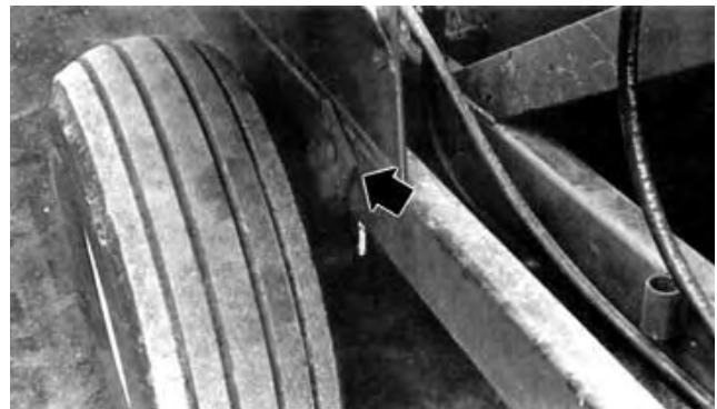
FIGURE 7. Transport Lock.

Transporting: The Rock-O-Matic 546 was easily transported. It towed well at speeds up to 40 km/h (25 mph). The 180 mm (7 in) transport clearance was adequate. One transport lock (FIGURE 7) prevented the grate from being lowered while transporting. The transport lock was located behind the left wheel and was difficult to reach. Modifications to provide a more accessible transport lock are recommended.