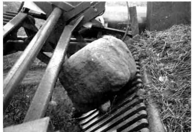
FIGURE 4. Typical rock jam.

To effectively remove surface rocks and to minimize soil retention in the hopper, forward speed had to be selected to suit field conditions. In scattered rocks, best performance was achieved with a tooth index 1 of about 1.3 in fields with light rock concentrations, 3.5 in fields with medium rock concentrations and 5.2 in fields with heavy rock concentrations. In windrowed rocks, best performance was achieved with a tooth index of about 3 in fields with light rock concentrations, 6.5 in fields with medium rock concentrations and 10.3 in fields with heavy rock concentrations. Operating at the recommended reel speed of 43 rpm, corresponding ground speeds