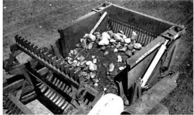
FIGURE 6. Hopper Capacity at the Standard 34 rpm Reel Speed.

grate is lowered to the ground until the hopper begins to rise. The hopper emptied completely and could pile rocks 1340 mm (53 in) high.