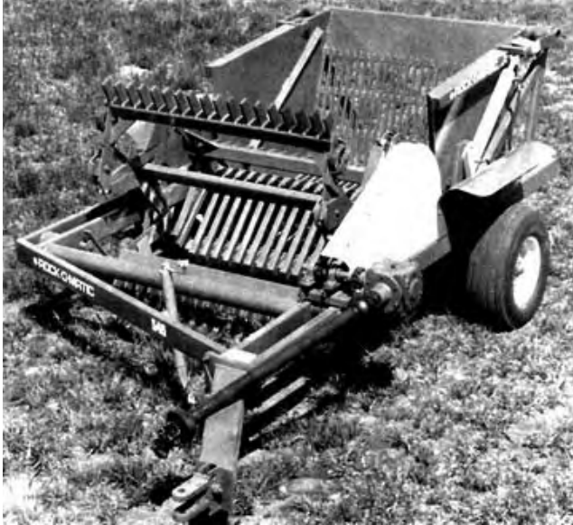
FIGURE 1. Rock-O-Matic 546.

$6,029.00 (July, 1981, f.o.b. Humboldt, complete with 540 rpm power take-off reel drive and optional reel shock absorbers and ductile grate.)