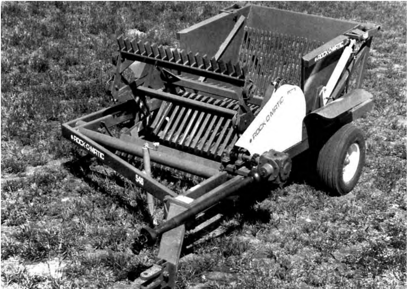
Rock-O-Matic 546 Rock Picker