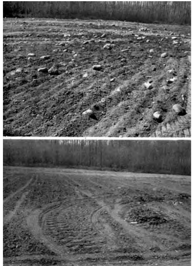
FIGURE 3. Performance in large rocks: (Top: Before picking; Bottom: After one pass with picker).

limited ground speed due to rock build-up on the grate. Increasing the reel speed to 43 rpm filled the hopper to capacity and increased the workrate without throwing rocks over the back of the hopper. It is recommended that the manufacturer consider modifications to increase the reel speed to about 45 rpm.