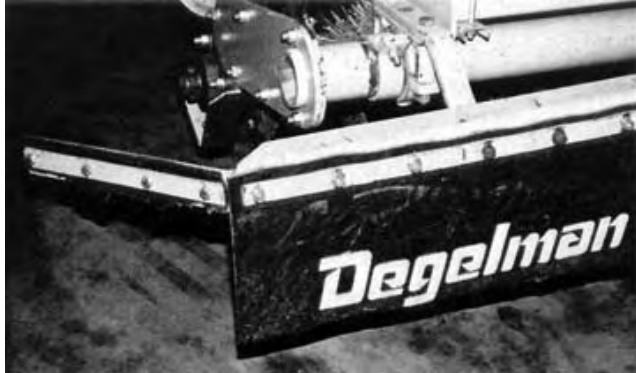
FIGURE 7. Tom Rock Deflector.

Rock Teeth: Breakage of rake teeth and rake teeth attaching bolts occurred mainly when windrowing rocks greater than 400 mm (16 in) in size. Tooth breakage was insignificant in smaller rocks.