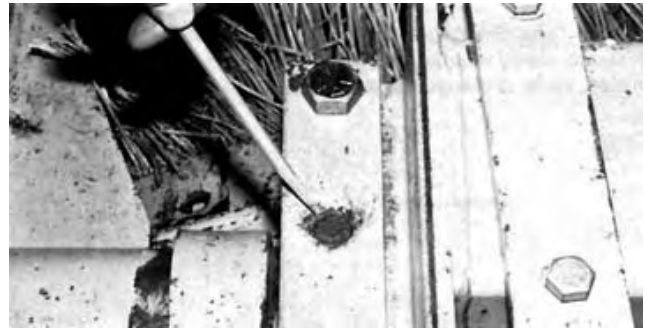
FIGURE 6. Soil Accumulation in Rock Shaft Grease Fittings.

damage. The deflector could be removed in less than 15 minutes.