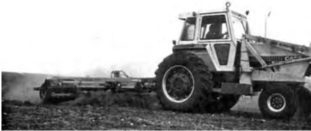
FIGURE 5. Typical Dust Conditions.

The windrower was relatively stable on hillsides. Skewing was never severe enough to affect operation.