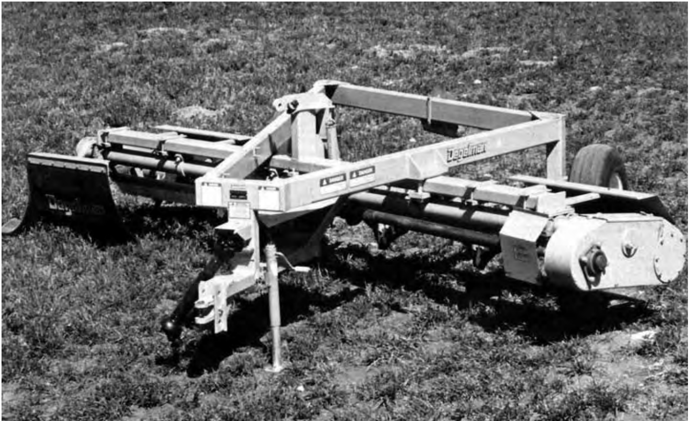
Degelman LC14 Rock Rake