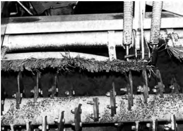
FIGURE 3. Small Rock Deflector Damaged by Large Rocks.

To effectively windrow surface rocks and to minimize soil retention in the windrow, forward speed had to be selected to suit field conditions. When set at an 18° rake angle best performance was achieved with a tooth index 1 of about 1.5 in fields with light rock concentrations, about 2 in fields with medium rock concentration and about 3 in fields with heavy rock concentrations. Since the rake drum speed was fixed at 143 rpm, corresponding ground speeds were about 8, 6 and 4 km/h (5, 3.7 and 2.5 mph) in light, medium and heavy concentration, respectively. FIGURE 4 shows the effect of ground speed on raking effectiveness in a field with medium rock concentration.