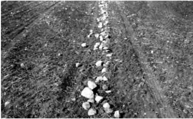
FIGURE 2. Typical Raking Performance in a Field Heavily Concentrated with Small Rocks. Optional Small Rock Deflector Attachment Used.

optional small rock deflector attachment effectively prevented carry over of small rocks in these conditions (FIGURE 2). The small rock deflector attachment should not be used in fields infested with rocks larger than 375 mm (15 in). If large rocks are caught and thrown over the drum, as occasionally happens, the small rock deflector can be damaged (FIGURE 3).