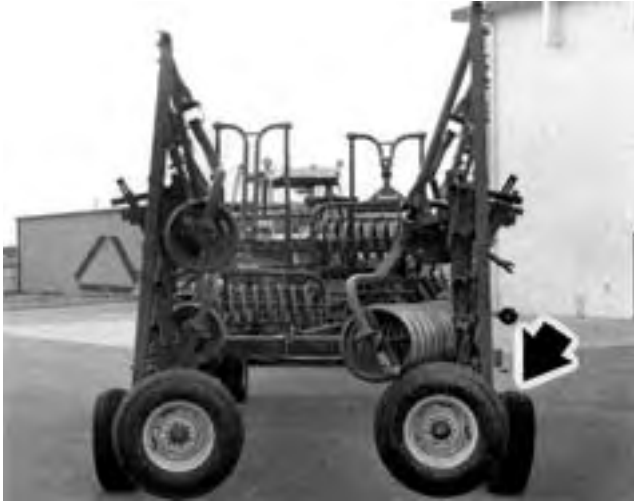
FIGURE 5. Excessive Camber in Right Transport Wheel.

Tire Blowout: The right boom frame had a 5 degree twist in it (FIGURE 5) causing the right transport wheel to have excessive camber. This in turn caused the tire to wear excessively (FIGURE 6) and eventually blowout. The problem was identified by the manufacturer as a misalignment during fabrication. Corrections were made to the jigs in the spring of 1987 to ensure future models would not have this problem. The manufacturer updated the machine at the end of the test.