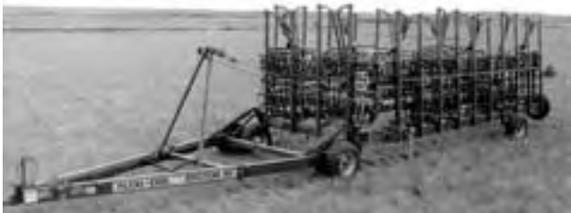
FIGURE 4. Flexi-coil System 95 in Transport Position.

Transporting: The ease of folding, unfolding and transporting the System 95 was very good. The unit was placed into transport position (FIGURE 4), using the hydraulic cylinders provided, in about four minutes. The hydraulic cylinders rotated the boom 90 degrees, lifting the harrow support arms, which raised both the harrows and packers off the ground. As the booms rotated, the transport wheels were lowered to the ground and the cable latch was disengaged. Driving the implement ahead slowly caused the wing cable pivot arm to swing upwards, allowing the wings to fold rearward for transport position.