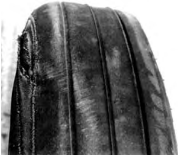
FIGURE 6. Excessive Tire Wear.

Packer Pillow Blocks: The pillow blocks on one packer broke causing the packer to separate from the packer draw (FIGURE 7). This occurred just after completing a sharp turn on a slope. The problem may also have been compounded by loose pillow block mounting bolts.