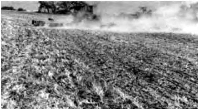
FIGURE 2. Stubble Field Seeded with an Air Seeder as the First Spring Operation. (Left: Before Soil Finishing, Right: After Soil Finishing).

square coil packers was approximately 104 lb/ft (1550 N/m). This packing force was adequate to form a firm seedbed for good crop emergence. Coverage by the coil packers was even and packer alignment was maintained when turning. In moist conditions, care had to be taken to avoid over packing of the seedbed.