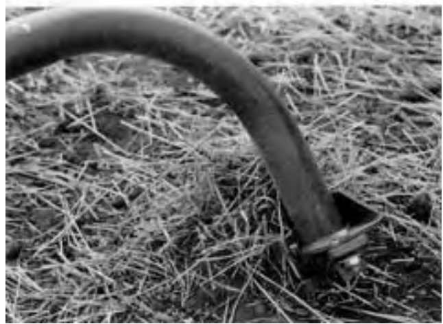
FIGURE 7. Upper: Packer Separation from Packer Draw, Lower: Broken Pillow Block.