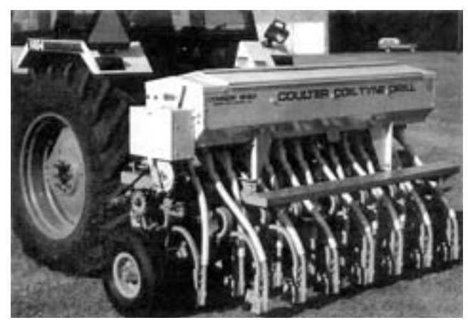
FIGURE 1. Connor Shea Coulter Tyne Drill.

Equipment: In Manitoba the Connor Shea Coil Tyne drill (FIGURE 1) generally represented a superior seeding system when compared to other zero-till drills or conventional tillage under average conditions. A PAMI Evaluation Report (#508) on this drill is available.