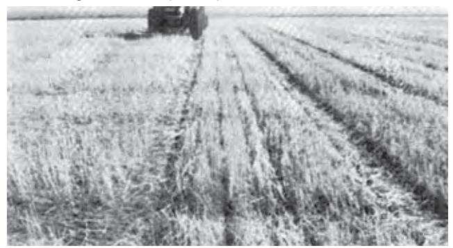
FIGURE 3. Soil surface before (left) and after (right) seeding into an untilled wheat stubble field.

very good. FIGURE 3 shows the soil surface before and after seeding into an untilled wheat stubble field. Soil and residue disturbance was very low. Ridge depths left by the units in untilled fields were 1 in (25 mm) or less. Ridge depths increased in soft soils or when seeding at deep depths. For instance, when seeding in soft moist soil the ridge was 2.5 in (64 mm).