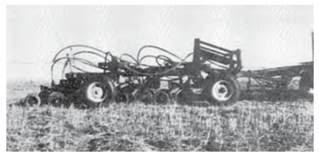
FIGURE 2. K-Hart Double Disk direct seeding units operating in field.