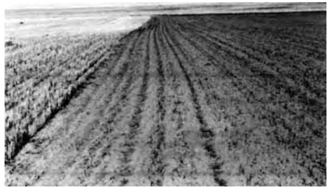
FIGURE 3. Wheat Emergence on Summerfallow