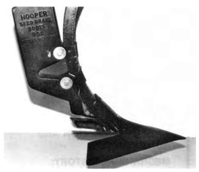
FIGURE 4. Hooper Seed Brake Boot Mounted on Cultivator Shank.

After the seed brakes were installed they were very easy to operate and only minor adjustments were required. Adjustments included repositioning seed brakes which had shifted on the cultivator shank.