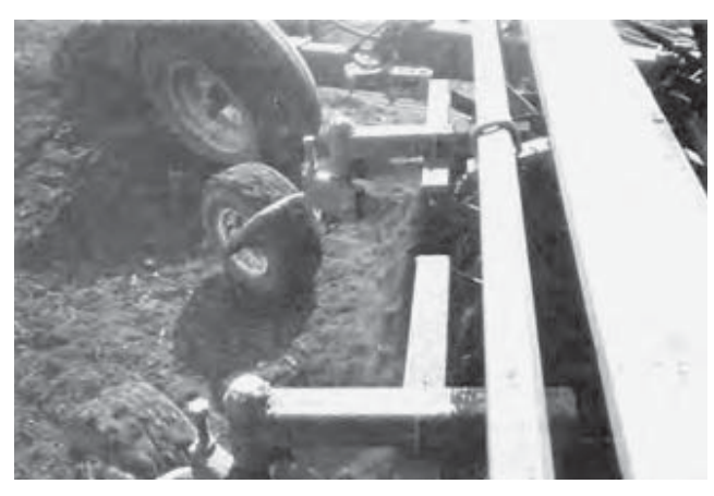
FIGURE 3. Operating in Wet Loam Soil.

The tires easily rode over heavy trash and clumps of straw.