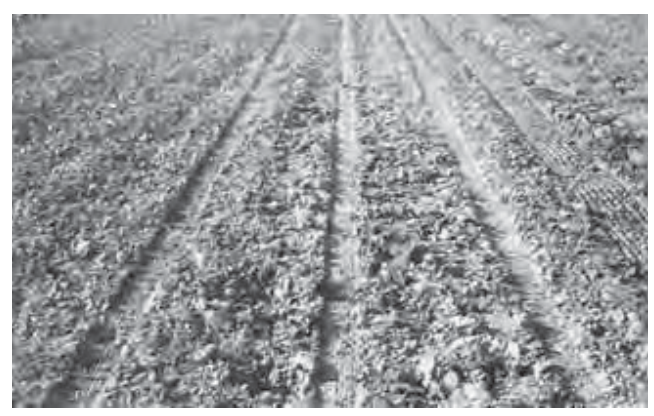
FIGURE 2. Jeannotte Tire Tracks Behind the Disker Seeder

The tire left a compacted track about 6 in (154 mm) wide (FIGURE 2), which was no longer visible after harrowing or packing.