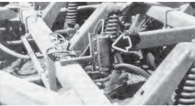
FIGURE 4. Senstek DCM-2 Depth Sensor Mounted on Cultivator Frame

Installation of the control console, electro-hydraulic valve, temperature sensor and three depth sensors took one man approximately three hours.