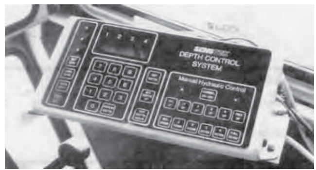
FIGURE 2. Senstek DCM-2 Control Console Mounted in Tractor Cab.

The Senstek DCM-2 depth control system was easily installed. FIGURE 2 shows installation of the control console in the cab of a Case 4690 tractor. Two holes had to be drilled in the tractor cab to mount the console.