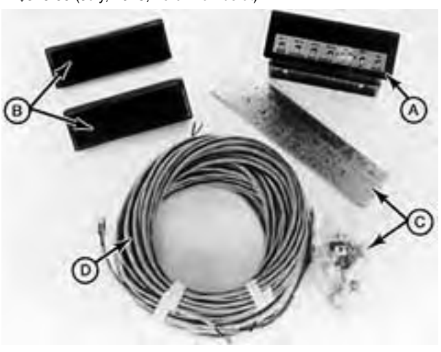
FIGURE 1. BEE Model 7410 Combine Loss Monitor: (A) Control Box (B) Sensors (C) Mounting Hardware (D) Wiring Harness.