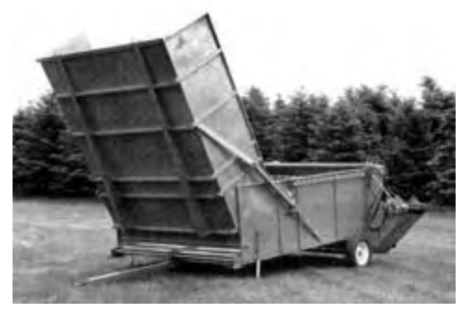
FIGURE 2. Transport Position.

During transport, the drawpole was permanently bent at the clevis hitch. It is recommended that the manufacturer modify the hitch and drawpole to prevent bending.