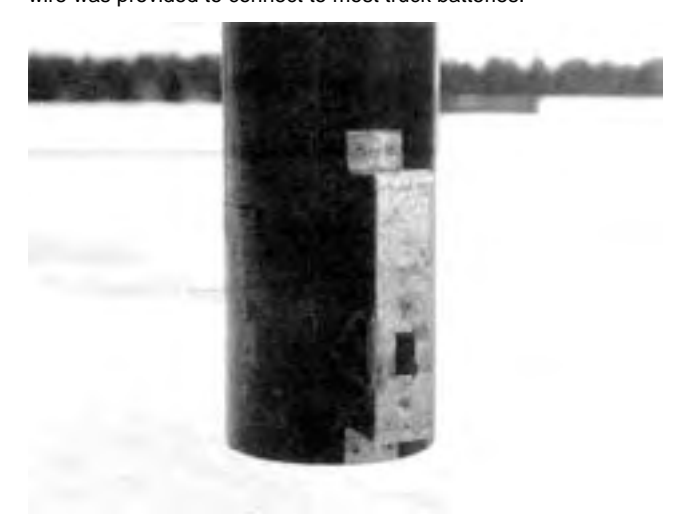
FIGURE 2. On-off Electrical Switch.

Operation: The telescoping downspout and flexible hose section made filling of a grain or fertilizer box very easy for one person. The on-off electrical switch (FIGURE 2), positioned in the handle on the downspout, was convenient and easy to use. It did not have to be held in the on position for continuous operation. Ample wire was provided to connect to most truck batteries.