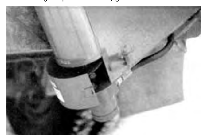
FIGURE 4. Auger Clean-out Gate

centre latch held the clean-out gate tight against the outside of the auger tube. No leakage occurred throughout the test (FIGURE 4). General rating for operation was very good.