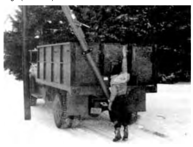
FIGURE 5. Folding Lever Difficult to Reach.

Transport: To place the auger in transport position, reaching the folding lever was difficult for an operator less than 6 ft (1.8 m) in height unless the truck box was tilted to at least a 30° truck box angle (FIGURE 5).