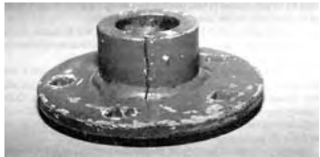
FIGURE 6. Cracked Hub.

Reel Drive Hub: The hub that connects the reel driven sheave to the reel axle failed at 87 hours and was replaced. The hub cracked at the broached slot for the lock key (FIGURE 6).