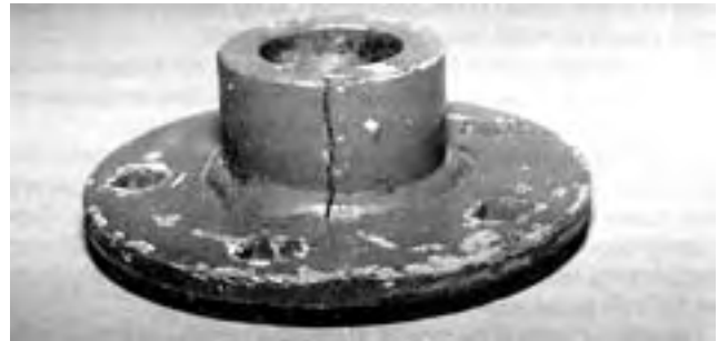
FIGURE 5. Cracked Cylinder Cap.

Reel Drive Hub: The hub that connects the reel driven sheave to the reel axle failed at 87 hours and was replaced. The hub cracked at the broached slot for the lock key (FIGURE 6).