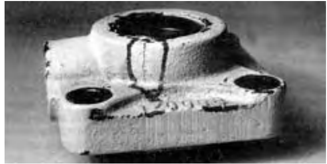
FIGURE 4. Bent Ram.

ram bent (FIGURE 5). The cylinder end cap was replaced.