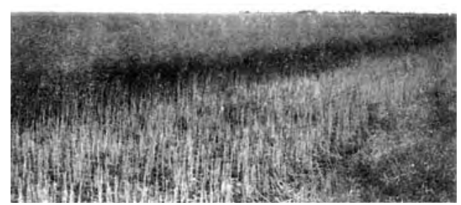
FIGURE 2. Crop Edge left by the Fuma Sabre in Rapeseed.

In flax, the Fuma Sabre cut cleanly and prevented crop from hairpinning on the divider. The hydraulic drive had adequate power. In the cereal crops, the powered divider cut well and left a clean crop edge. However, in leaning cereal crops, the powered divider had to be removed because some heads were being cut off and lost on the ground. In straight cereal crops, the Fuma Sabre was not needed.