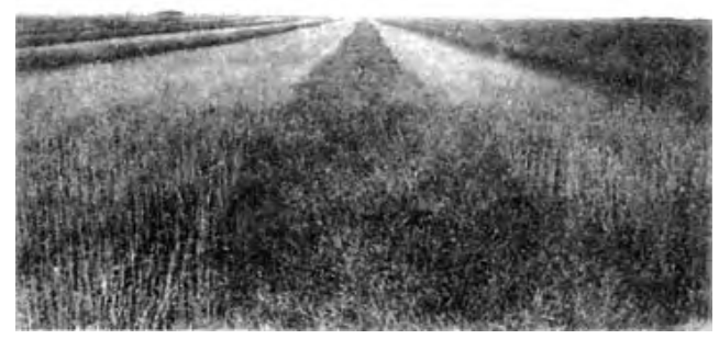
FIGURE 3. Uniform Rapeseed Windrow Obtained with the Fuma Sabre.