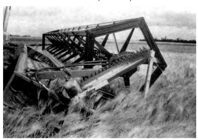
FIGURE 4. Fuma Sabre Stored for Use in Cereal Crops.

The Fuma Sabre was easily removed for windrower operation in cereal crops by unbolting the mounts and disconnecting the hydraulic drive. When removing and reinstalling frequently during the tests, the divider was simply stored on the angle iron bracing, and the flow control was shut off (FIGURE 4).