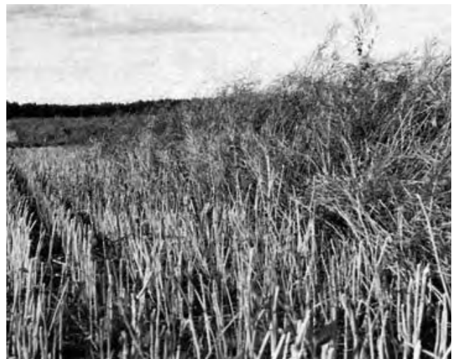
FIGURE 2. Standing crop at edge of swath when Separ divider was used.

Crop Loss: In rapeseed, there was no appreciable crop loss at the divider due to crop separation when the Separ divider was used. When using a standard divider in rapeseed, the crop was separated by pushing it down beneath the divider. This left a path of flattened crop which was retrievable only by cutting in the opposite direction on the next pass. The Separ, however, left a clean standing edge, without any significant loss of rapeseed pods (FIGURE 2).