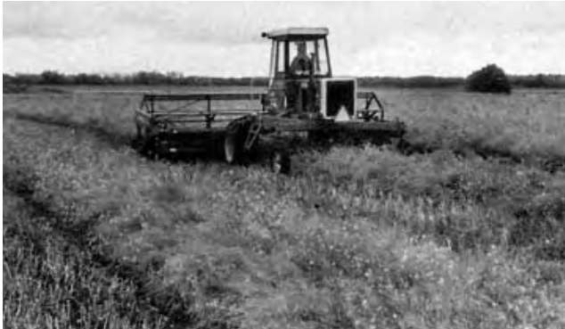
FIGURE 3. Windrowing rapeseed with the Separ Attachment.

Peas: Field tests conducted in peas were inconclusive due to the closeness of the crop to the ground.