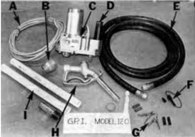
FIGURE 1. GPI Model 120 Fuel Transfer Pump (A) Battery Cable, (B) Bung Adaptor, (C) Pump Body, (D) Dust Shield, (E) Outlet Hose, (F) Fuse Holder, (G) Battery Clamps, (H) Outlet Nozzle, (I) Suction Pipes.

$197.00 (January, 1979, f.o.b. Lethbridge)