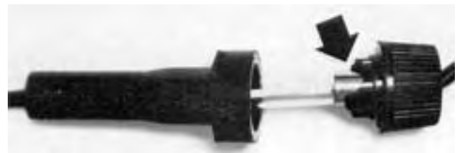
FIGURE 4. Broken Fuse Holder.

Several problems occurred during the functional evaluation. The fastener on the fuse holder broke off (FIGURE 4) and required replacement. The nozzle dust shield (FIGURE 1) was insecurely fastened and fell off frequently. It is recommended that the manufacturer make modifications to prevent the fuse holder fastener from breaking off and the nozzle dust shield from falling off.