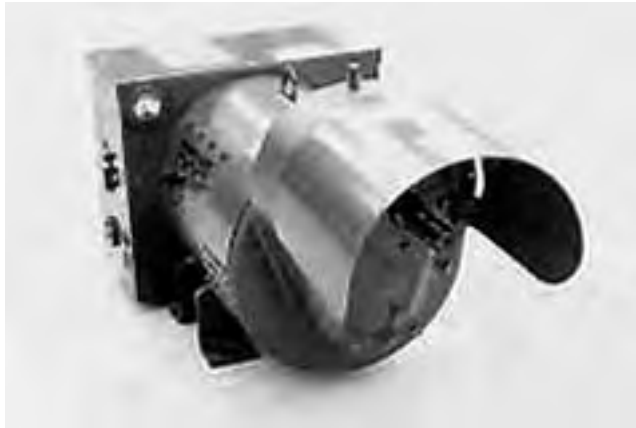
FIGURE 1. Winpower 50/30.

$3,965 (June 1984, f.o.b. Portage la Prairie, Manitoba)