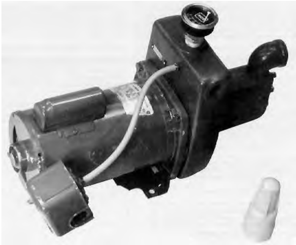
GSW 561006 CANC SHALLOW WELL JET PUMP