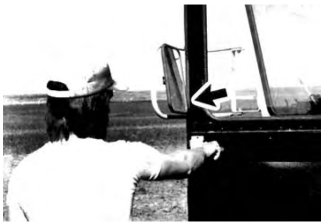
FIGURE 7. Interference between Rear View Mirror and Cab Door.

The rear view mirror provided poor rear visibility when loaded. Interference between the cab door and mirror (FIGURE 7) prevented the door from completely opening. Modifications to the rear view mirror location are recommended to eliminate door interference and to improve rear visibility when loaded.