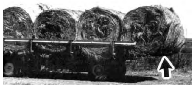
FIGURE 3. Partially Opened Tailgate when Loaded with Eight, 72 in Diameter Bales.

Load Quality: The New Holland 8500 formed a durable load, which transported well with little shifting or settling. Material loss during transporting was negligible. When handling 72 in (1830 mm) diameter bales, the tailgate was forced partially open during the last cycle of the pusher (FIGURE 3). The partially opened tailgate did not affect load quality. However, to ensure safe road transport, modifications to permit adequate accommodation of eight, 72 in (1830 mm) diameter bales are recommended.