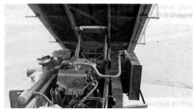
FIGURE 9. Limited Visibility when Backing into Unloading Position.

Extreme care must be used when working under a raised deck. A mechanical lock was provided for the load deck.