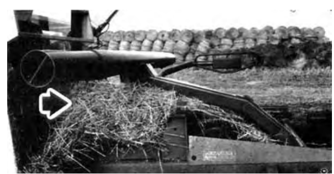
FIGURE 8. Collection of Loose Material below Pusher.

Loose material often collected below the pusher (FIGURE 8). Pusher operation was not affected but excessive build-up required occasional removal.