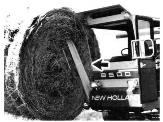
FIGURE 2. Bale Interference with the Operator's Cab while Loading 72 in (1830 mm) Soft Core Hay Bales.

When loading loosely formed or poorly tied bales, the cross conveyor arm occasionally slipped beneath the bale and failed to push the bale to the left side of the load deck. When loading 72 in (1830 mm) diameter soft core hay bales, the inside edge of the bale often interfered with the right side of the operator's cab (FIGURE 2). Modifications are recommended to eliminate this interference as damage to the operator's cab side window occurred on four occasions.