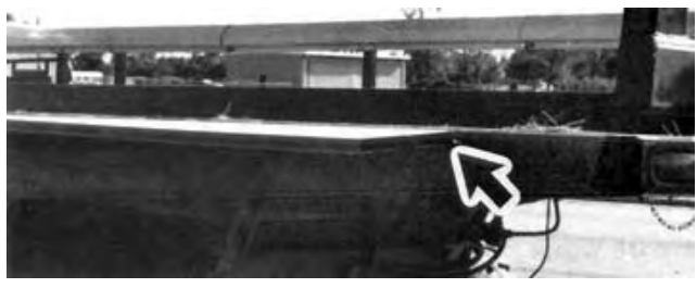
FIGURE 11. Bent Load Rack Extensions.