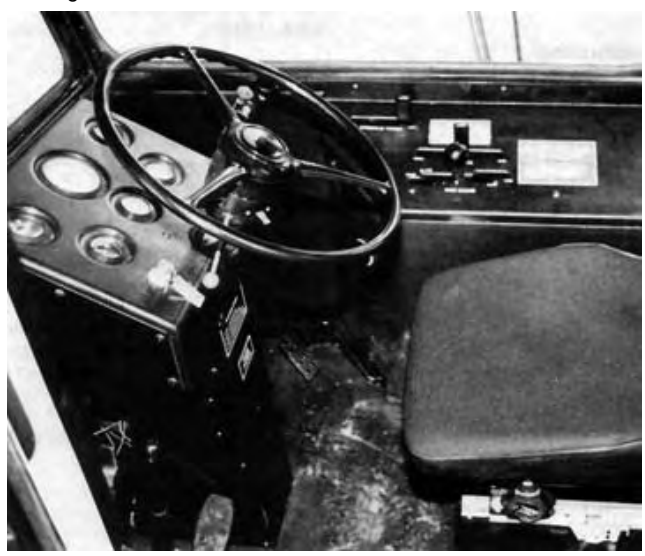
FIGURE 6. New Holland 8500 Instrument and Control Arrangement.

Instruments and Controls: FIGURE 6 shows the instrument and control arrangement of the New Holland 8500 operator's cab. Loader and load deck controls were easily accessible from the operator location. Visibility of the loader was very good. The gear shift lever and foot throttle were inconveniently located. The operator had to reach forward to shift gears while maintaining an awkward leg position. Operator fatigue occurred after several hours. Modifications to the gear shift lever and foot throttle locations are recommended.