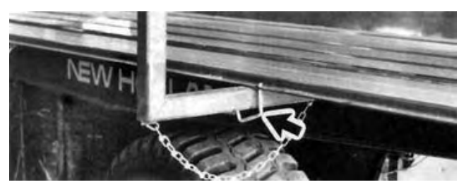
FIGURE 10. Bent Load Rack Extension J-Pins.